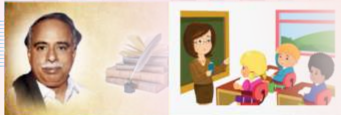
அறிஞர் அண்ணாவின் பார்வையில் ஆசிரியர் பணியின் சிறப்பு

ஆசிரியத் தொழிலில் ஈடுபட்டுள்ள அனைவரையும், மகிழ்ந்து பாராட்டுவதற்குரிய மிக முக்கியமான காரணம், ஆசிரியராக இருந்தால் மட்டுமே பெறக்கூடிய சில இயல்புகளை மற்ற எத்துறையிலும் பெற முடியாது என்பதுதான். என் தோழர்கள் என்னை அடிக்கடி கேட்பார்கள், எவ்வளவுதான் மாற்றுக் கட்சியினர் தூற்றினாலும், “நீங்கள் ஒரு துளியும், ஆத்திரப்படாமல் இருக்கிறீர்களே! காரணம் என்ன என்று?” அதற்கு நான் சொன்னேன், ஒருவன் ஆறு திங்கள் ஆசிரியராய் பணி செய்து விட்டால் போதும்... அதற்குப் பிறகு. பொறுத்துக் கொள்கிற தன்மையை யாரும் அவருக்குக் கற்றுக் கொடுக்க வேண்டியது இல்லை. தானே வந்துவிடும்.